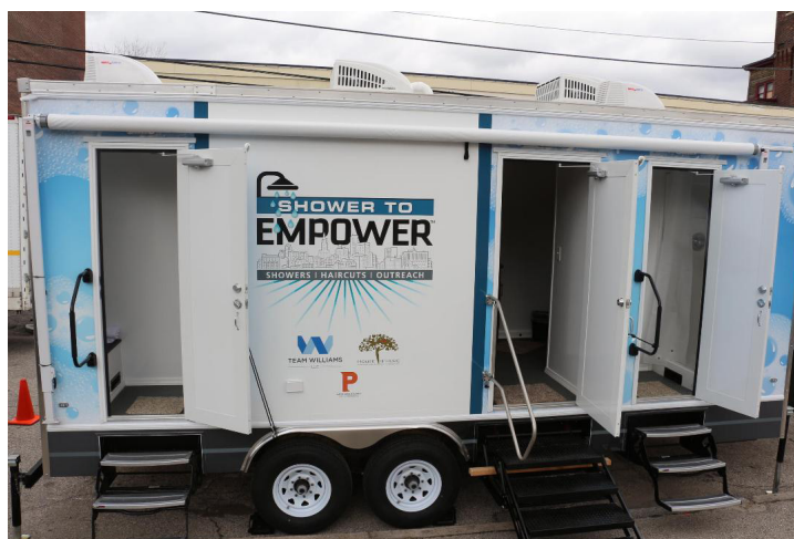
Shower to Empower trailer, story on page one